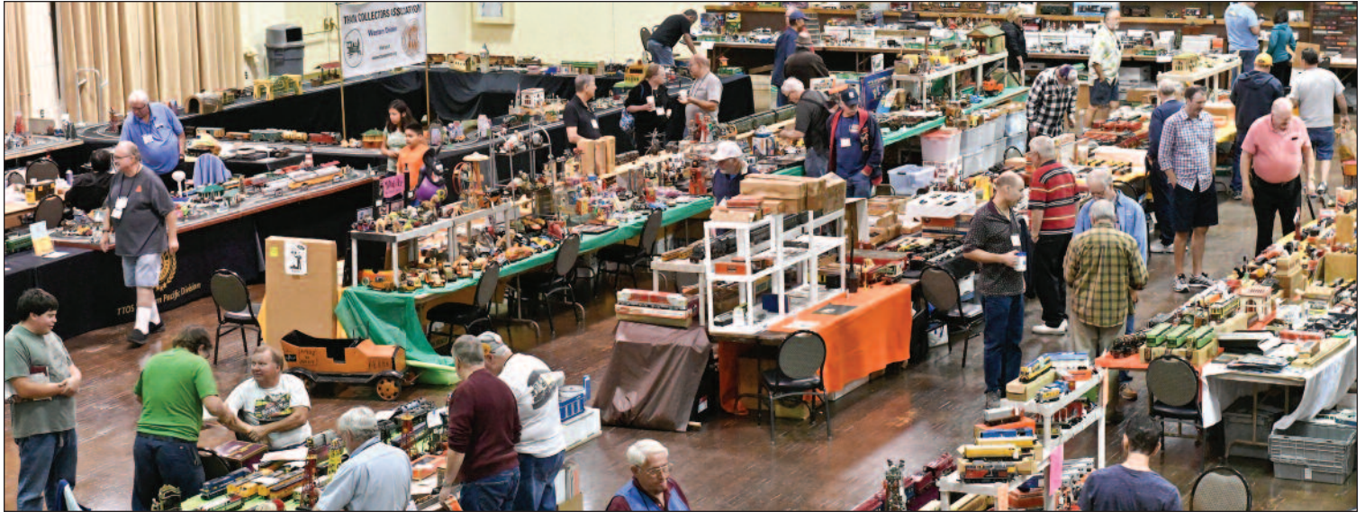
Table Sales • Auction • Grand Drawing • Layouts Marx Show & Tell