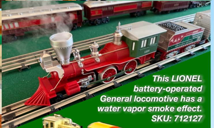
This LIONEL battery-operated General locomotive has a water vapor smoke effect. SKU: 712127