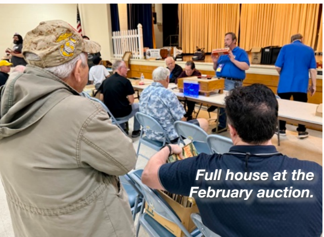
Full house at the February auction.