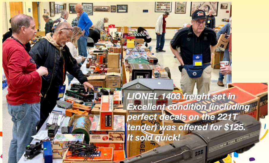
LIONEL 1403 freight set in Excellent condition (including perfect decals on the 221T tender) was offered for $125. It sold quick!