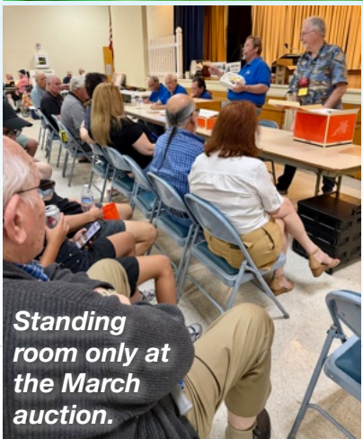
Standing room only at the March auction.