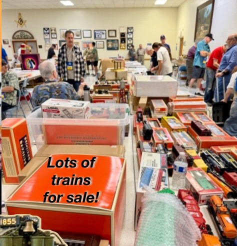
Lots of trains for sale!