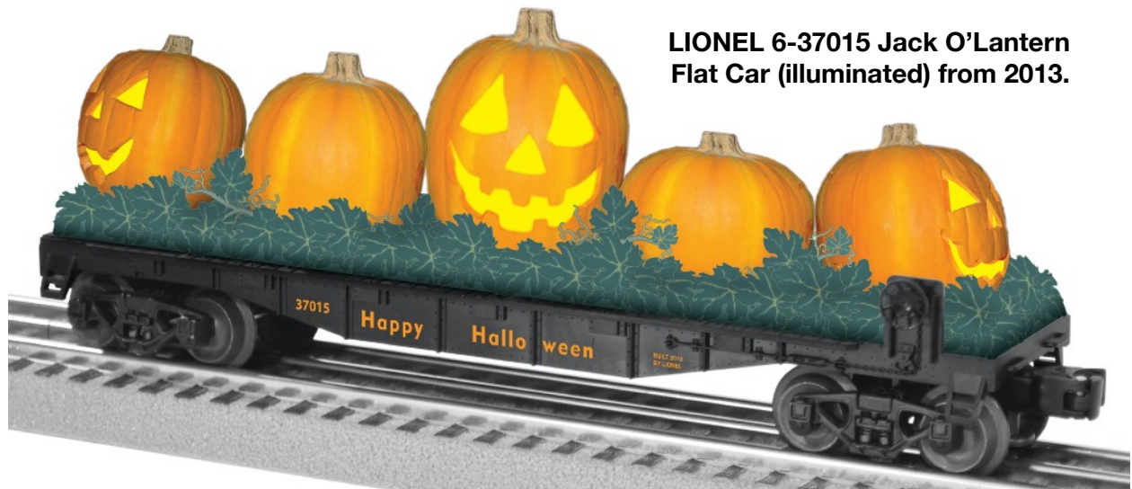
LIONEL 6-37015 Jack O'Lantern Flat Car (illuminated) from 2013.