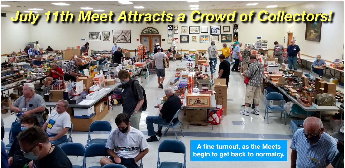
A fine turnout, as the Meets begin to get back to normalcy.