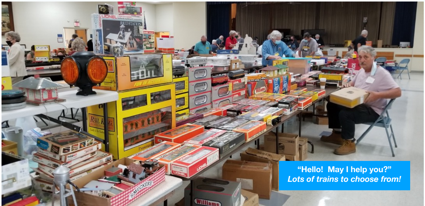
Table Sales Were Brisk at the June 6th Meet!

"Hello! May I help you?" Lots of trains to choose from!