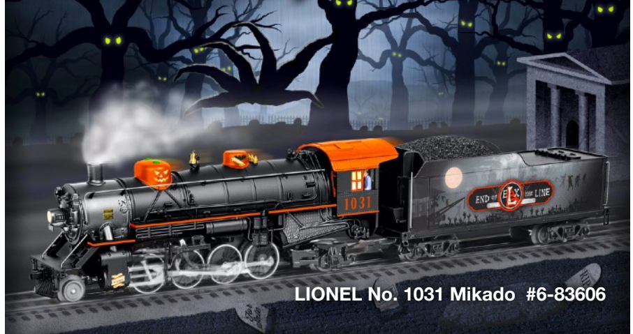
LIONEL No. 1031 Mikado #6-83606

H ALLOWEEN has become Lionel's 2nd biggest holiday of the year. Now's the time to add some creepy touches to your train layout for 2021. Many toy train operators decorate for October 31st by adding miniature pumpkins, candy corn, cauldrons, spider webs or skeletons to the trains. Dollar stores are a great source for such kitschy stuff!