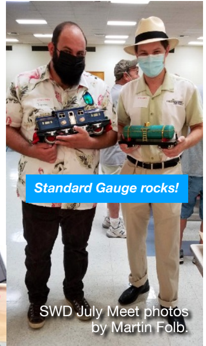
Standard Gauge rocks!