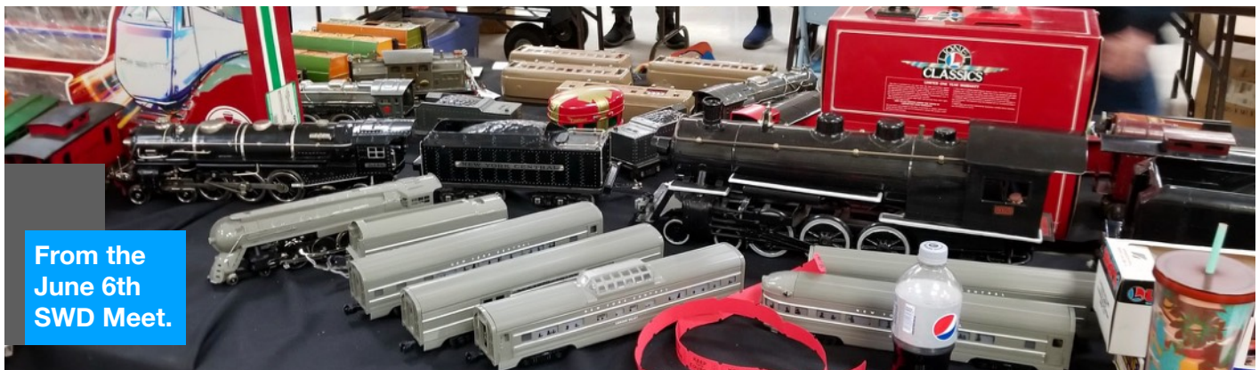
From the June 6th SWD Meet.