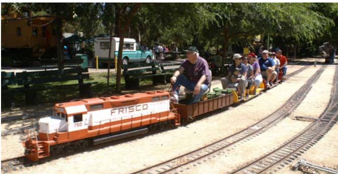
A Frisco diesel takes a spin on the pike.