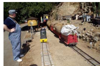
Photo at right: All 1 1/2 miles of track must be free of grasses, vines, leaves, and branches. Plus vines, shrubs and trees must be trimmed back to not impede trains. All trimmings are bagged and conveniently hauled out on work trains which also transport work tools.