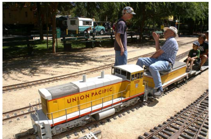
The UP Engineer answers questions of a by-stander.