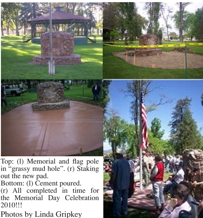
Top: (l) Memorial and flag pole in "grassy mud hole". (r) Staking out the new pad. Bottom: (l) Cement poured. (r) All completed in time for the Memorial Day Celebration 2010!!!

He was a good friend and had a good heart. I'll miss him and so will a lot of other train people.