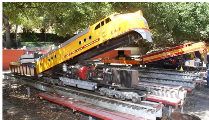
Diesels ready for servicing.