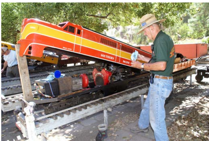
A closer look at the "innners" of one of the diesels.