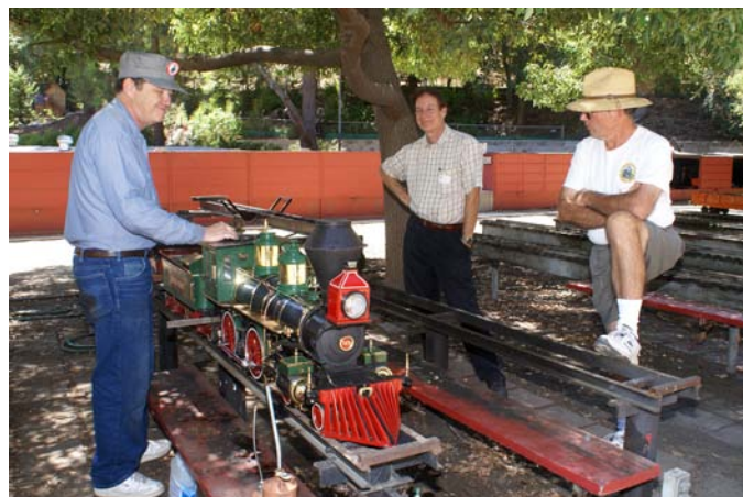
Checking out this little beauty.

Photo at right: All 1 1/2 miles of track must be free of grasses, vines, leaves, and branches. Plus vines, shrubs and trees must be trimmed back to not impede trains. All trimmings are bagged and conveniently hauled out on work trains which also transport work tools.