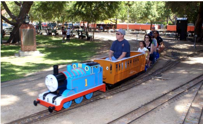
The always smiling Thomas the Tank engine thrilled children.