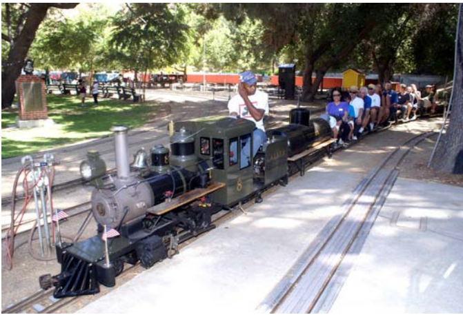
A new addition, Steam Engine No. 8 with tender, passenger cars and caboose is club owned and operated by the Los Angeles Live Steamers.