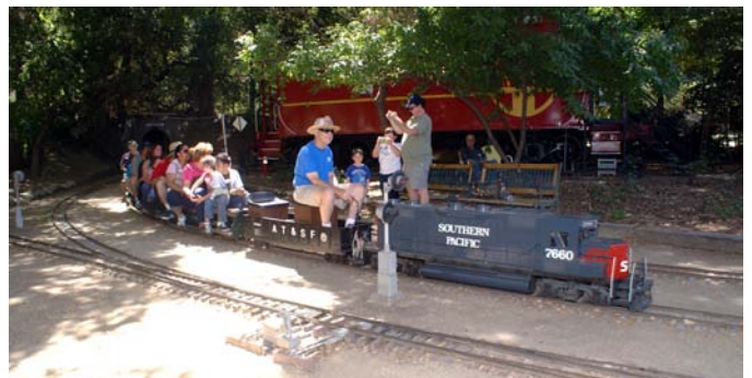
The SP diesel loaded with passengers.