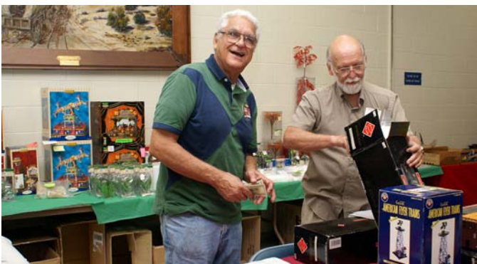
A happy seller — a happy buyer