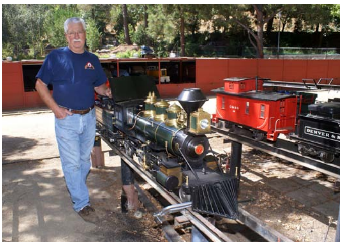
A transfer table assists owners moving engines and cars from the storage barn to the static work stations.

Saturday, August 14, 2010 was a scheduled work day for LALS members, including engine and car routine maintenance and repairs, plus gardening along the right of way.