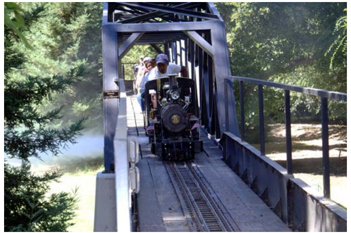
Number 8 crossing the bridge above the meadow. Note the steam blast towards the left.