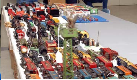
Tables full of trains & accessories