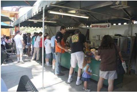
The hungry crowd at Kountry Kitchen!

We fed over 300 attendees hamburgers and hot dogs with all the fixin's, salad, chips, cookies, sodas and water.