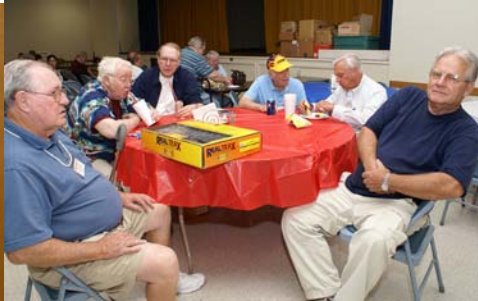
Testing a repair; waiting for the auction; checking parts.