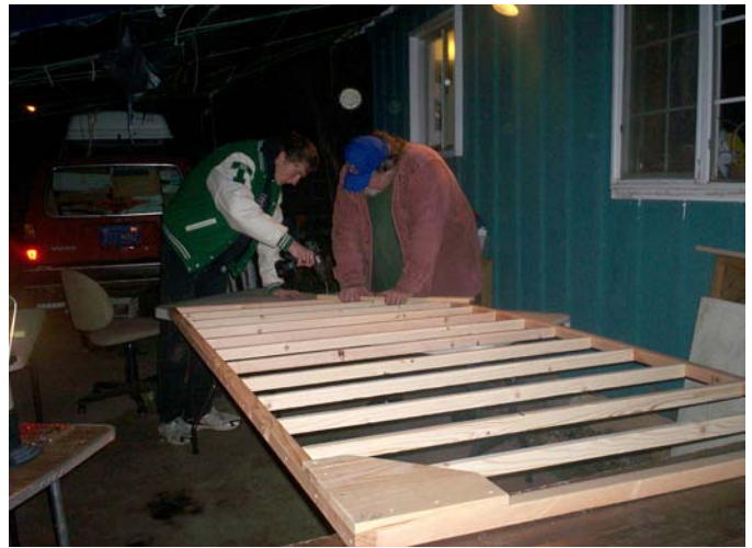
Building the frame on a blustery night with snow and rain threatening. Gluing in cold weather is a challenge.

After the felt went on, everything started falling together rather quickly. I painted the underside of the layout flat black and we started laying the track and screwing it in place. The wiring underneath went in and on April 22nd, a train ran on our creation for the first time. The Tehachapi Loop Model Railroad Club had an upcoming train show and we wanted to make that